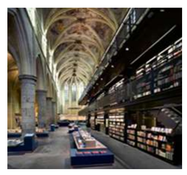
Fig. 7. Bookstore în Dominican Church

in the 13th century, in a Gothic style. The same architects designed two other libraries for the same client, but this time something special was intended.