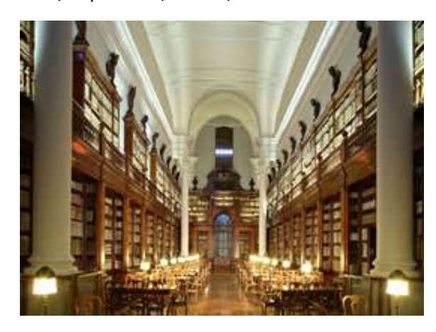
Fig. 2 The Laurentian Library lecture room