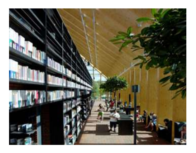
Fig 11. Arh MVRDV, Book mountain Spijkenisse, The Netherlands Source.:http://www.dezeen.com/2012/10/04/book-mountain-library-pyramid-by-mvrdv/

Because the natural light penetrates directly into the room, there is the risk for the books to degrade in time. The library also contains an auditorium, an education centre, rooms, offices, stores and a chess club. The shelves are made from recycled fireproof flower pots.