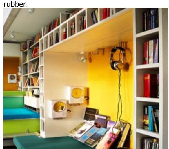
Fig 13. Library Bus, Kiruna, Sweden, Source: http://www.shearyadi.com/myworld/library-bus-of-the-year-by-the-swedish-librarian-society

classes and movie projections. The bus function is not only a book transportation means, but also a culture recipient and a meeting place. During the night, the bus becomes a lamp to attract the people around. The shelf frames are made of aluminium and are covered with white paint. The chairs are made of MDF. The floor is made of circular grey