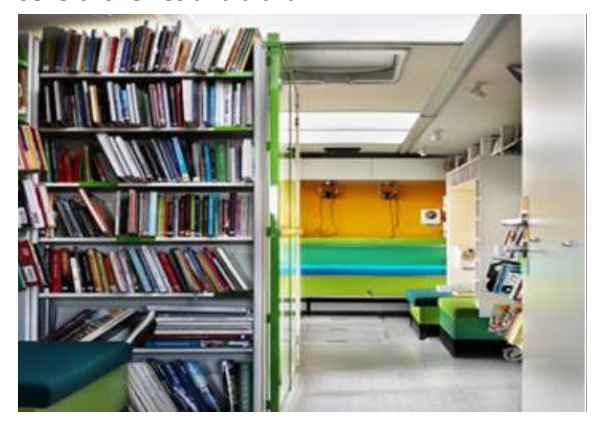
Fig 12. Library Bus, Kiruna, Sweden, Source: http://www.shearyadi.com/myworld/library-bus-of-the-year-by-the-swedish-librarian-society/

(Fig.12,13.) A new innovating location for a library was designed and built by some architects in a bus. This library fulfils several functions such as library and a small cinema. The bus shape is designed to include a maximum of services. The front part of the bus is organised as a traditional library with several shelves and a chair.