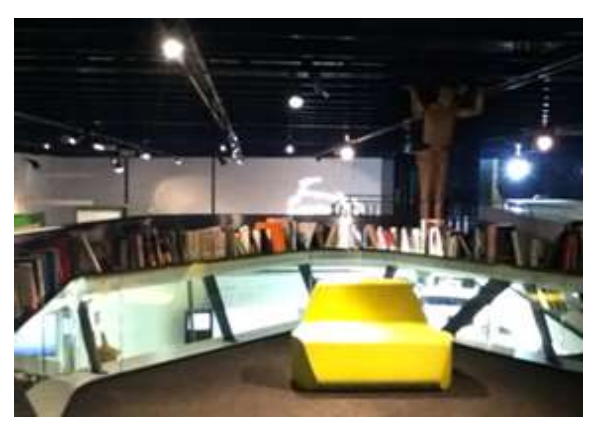
Fig. 5. Ars Eelectronica Center, Linz

The "Ars Electronica" Center plays somehow paradoxically precisely the role of museum of electronic art, or better said of exhibition space or manifestation media provided that it facilitates the direct contact with an ephemeral product, be it real or virtual, resulted following an act of creation sustained by computer use. Moreover, "Ars Electronica" is at the same time the place where a number of specific projects are released, provided that it has an interdisciplinarity with a multitude of scientific areas. The public is at its turn encouraged to interact with the "Exhibits" from the museum in a ludic process meant for all ages. The collaboration between artists and scientists in approaching some complex themes (climate change, population increase, environmental pollution etc.) is completed by the direct intervention of the visitors.