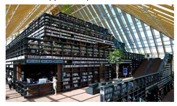
Fig 10. Arh MVRDV, Book mountain Spijkenisse, The Netherlands

It is a library similar on the outside with the classic Dutch farms. (Fig.10,11.) The construction has the shape of a pyramid with brick walls and the roof is made of glass on wood structure. The name of the library comes from the spiral made of book selves, routes and terraces that come around the central space on a length of 480 m on a height developed on the 5 shelf levels going upwards to the central coffee shop positioned towards the pyramid top.