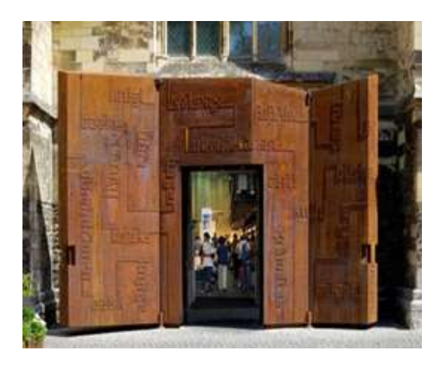
Fig .8. Bookstore în Dominican Church

Although originally the customer's intent was to divide the chosen area on two levels, this intention was not appreciated by the architects because they wanted to maintain and value the beauty of the church. To satisfy both sides, the area was divided in two, one part compartmented on two levels and the other left free. The al-