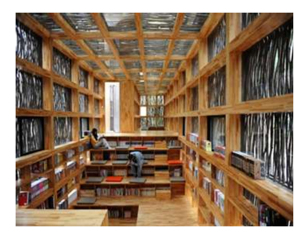
Fig 9. Arh Li Xiaodong, Liyuan Library, 2011

It was intended to create a space were the locals would feel comfortable and as close to the nature. [7] The construction is executed in a proportion of 90% from local materials found around the site. The outer walls are made of glass panels covered with wooden "canes" found at the locals, with the aim of preventing the light from penetrating directly inside, positioned on a steel frame. (Fig.9.)