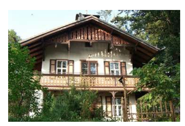
Fig. 6. Villa in Heimatstil - Swiss style, Burgberg Bavaria

and in the crown lands, this phenomenon was received with enthusiasm. For the nobility, the Tyrolean or Swiss farm became the symbol of a healthy, natural rural life, associated with the noble prestige. Heimatstil is characterized by the use of wood for the facade, carved beams and rustic ornaments, taking models from local folklore. Its decline inspired by the alpine architecture is called the Swiss-style (Fig. 6) [8].