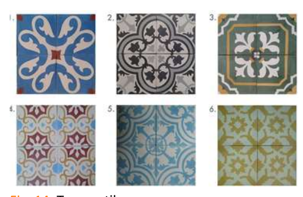
Fig. 14. Terazzo tiles

Considering that ornamentation is unlikely to occur in the restoration process, the decoration of the ceilings will be discrete, possibly having a supporting role for lighting. A number of original carpentry kegs have been preserved in the hotel, where possible they will be restored and integrated into the design.