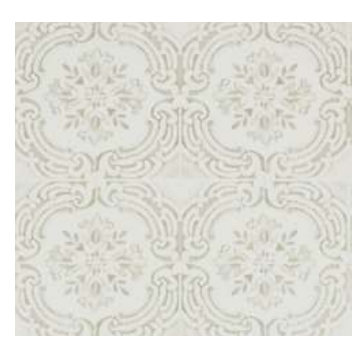
Fig. 13. Wallpaper with oriental motifs

The proposal for flooring is the use in the ground floor of the terraced terraces with floral or oriental inspiration (Fig. 14).