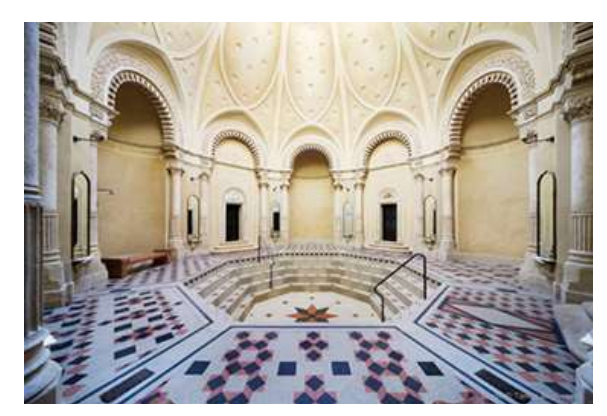
Fig. 5. Moorish Hall, Raitzenbad, Budapest

After banning gambling in 1872, spas invested in the baths to continue to be attractive to guests. Such a thermal bath is Raitzenbad in Budapest (Fig. 5) [1].