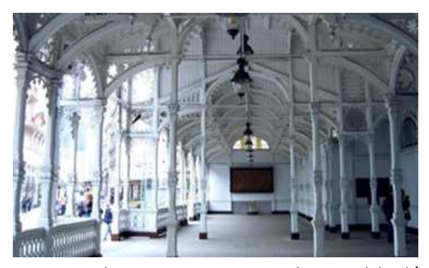
Fig. 2. Drinking water springs pavilion, Karlsbad/ Karlovy Vary

icated to social events, dedicated to education, communication and leisure for a large number of guests. Specific programs have been developed, such as the spa house, the drinking room and the thermal baths. There were landscaped gardens, hotels and villas, theaters, museums, mountain railways and watchtowers. Spa buildings no longer combine all functions, such as public halls, bathrooms and accommodation under the same roof, as happened during the Baroque period. The mineral water drinking room or pavilion (Fig. 2) was a well-known construction type, usually spread through covered galleries called colonnades [1].