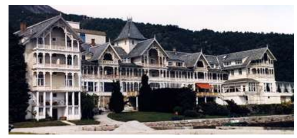
Fig. 7. Kviknebalestrand Hotel, Norway

Another historicist architectural trend that emerged in the 19th-century, along with the development of seaside resorts is Bäderstil (Fig. 7).