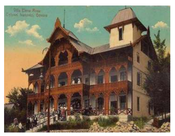
Fig. 9. Elena Rosa villa, Govora

In the spa resorts on the current territory of Romania, we can find examples of 19th-century Heimatstil/Spa architecture buildings, which attest to the importance and popularity of the hunting activity among the people of those times as well as the architectural program and this widespread style until the beginning of the 20th century in Central and Eastern Europe [13]. The Elena Rosa Villa in Govora is built in the Heimatstil/spa architecture style under Romanian administration (Fig. 9).