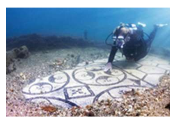
Fig. 1. Roman mosaic, Baiae, archaeological site Gulf of Napoli

and has become an important economic factor. In the second half of the 17th century, the habit of consuming mineral waters became more important than the habit of bathing [1].