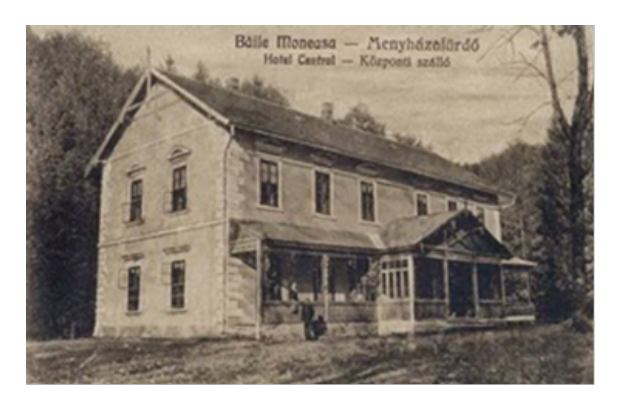
Fig. 11. Hotel Central, Băile Moneasa