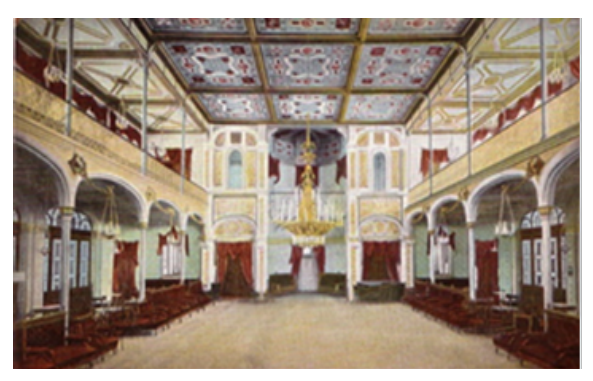
Fig. 3. The main hall, Kurhaus Băile Herculane

The 19th-century spa building (Kurhaus germ.) is a building dedicated exclusively to social events. Bathrooms and accommodation rooms are outsourced to dormitories and hotels specially built for this purpose. In the center of the spa building, there is a large hall (Fig. 3). In addition, there are several auxiliary rooms for a variety of activities such as gambling, reading and restaurant operation [1].