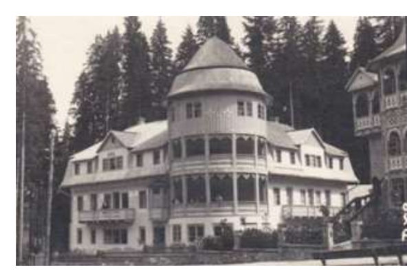
Fig. 10. Emil villa, Borsec

The Emil Villa in Borsec is built in Heimatstil/spa architecture style under Romanian administration (Fig. 10).