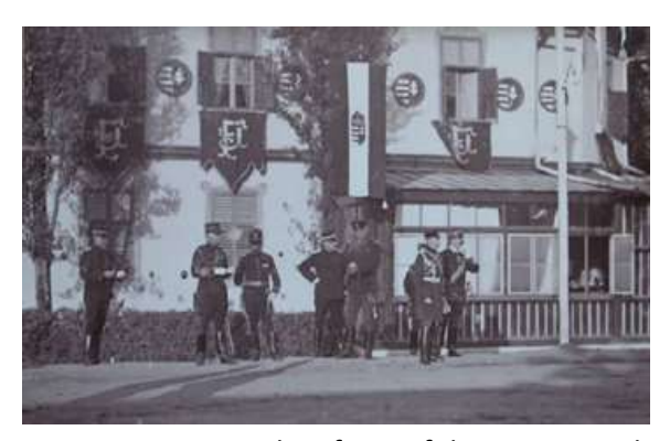
Fig. 12. Franz Joseph in front of the Bazar Hotel, 1895

Hotel Bazar is located at the northern end of the Central Park, in the vicinity of the Imperial Baths and Muschong Hotel.