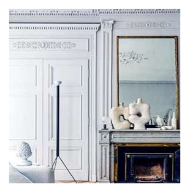
Fig. 17. Example of ornamentation applied to the door leaf