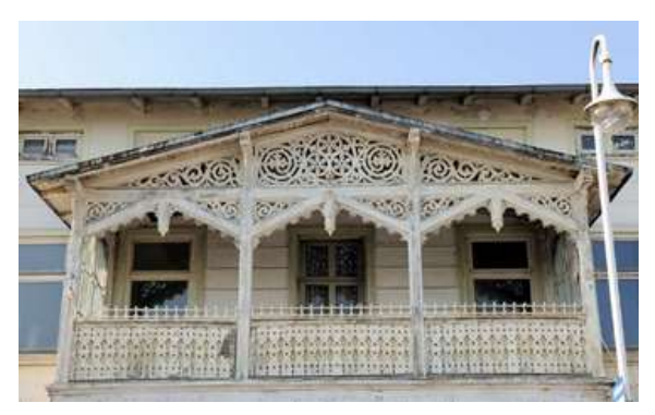
Fig. 8. Loggiahaus, Sassnitz, Ruegen

The new hotels and guest houses have been built as functional buildings, serving the need to host a lot of guests. The construction activity is subject to various stylistic elements. The practice was to take various elements and ornaments from Heimatstil-Swiss style and to apply them to the so-called house with balcony or terrace, Loggiahaus (Fig. 8). The Loggia is considered as an independent component without a constructive connection to the building, made largely of industrial wood panels. The ornamentation is extremely varied, with floral or geometric decorative motifs, of folkloric or even oriental inspiration [10].