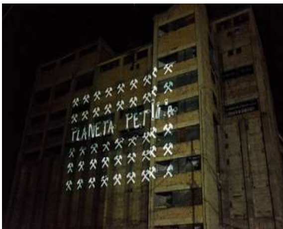
Fig. 11. Projection on a mine building. Ovidiu Zimcea (2018)

Through tactical urbanism interventions, both Barbu and the professionals bring the citizens and the administration in Petrița closer to the main aim: create a new post-industrial identity through the process of regenerating the industrial heritage site of Petrița Mine.