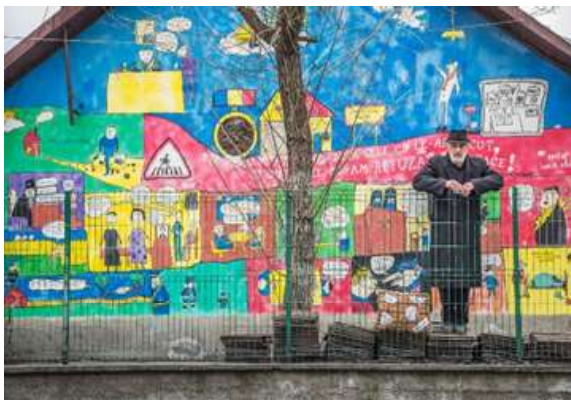
Fig. 1. Ion Barbu in front of Ion D. Sîrbu Memorial House. Planeta Petrița (2018)

ries of workshops and cultural events to promote the idea that the buildings of the coal mine must be preserved as industrial heritage. They also started working on the project that finally, after four years, reached the positive reaction from the Ministry of Culture. The architects (originally four, now part of a team of at least 10 volunteer professionals) remain a solid group of stakeholders that promote the project, try to identify solutions and create opportunities for the post-industrial site [5].