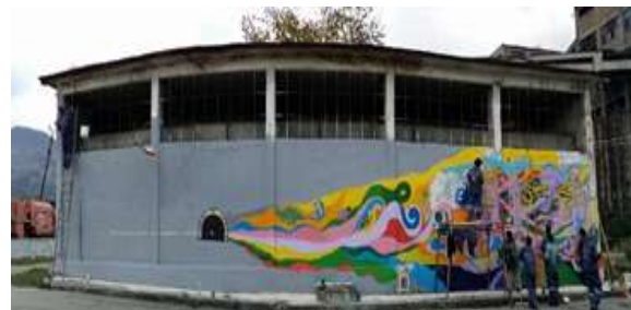
Fig. 7. The Pompadou Center. Planeta Petrila (2014)

After a few years, Barbu started a complex project of tactical intentions regarding the representative or neglected public spaces in Petrila. They were only presented virtually, through a social network.