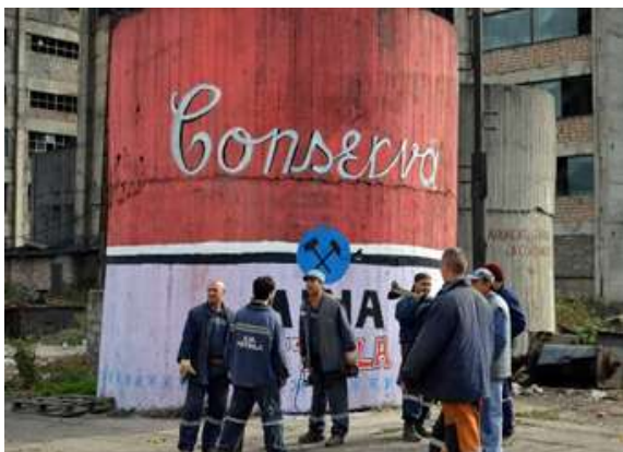
Fig. 2. Mural on a former building at the Petrița Mine. Planeta Petrița (2014)

Another stakeholder, maybe the most important, is the local authority. Petrița Mayoralty was the one that initiated the whole listing process for the site and will administrate it in three months. It lacks the know-how necessary to implement this type of project and admits the need for collaboration with professionals and local NGOs.