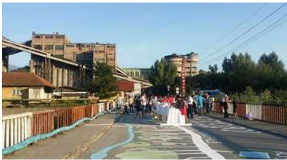
Fig. 8. The Industrial Heritage Days. Planeta Petrita (2015)