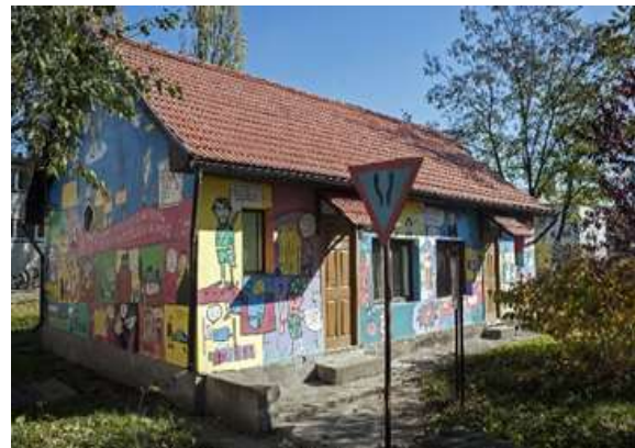
Fig. 6. The Ion D. Sîrbu Memorial House. thebarbu.ro (2017)

The next tactical intervention regards the Ion D. Sîrbu Memorial House, a ruin before 2009. Through his association, Barbu managed to repair the historical monument through an unconventional style, without permits or any architectural project. Through another example of guerilla tactics, he managed to force the local authorities (the actual owners) to open the monument to the public and leave it under the supervision of Barbu's Association.