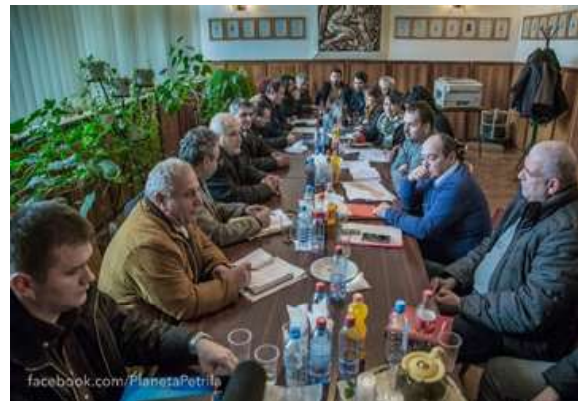
Fig. 3. Meeting between the main stakeholders at the Petrița mine, January 2016. Planeta Petrița (2016)

Another stakeholder, maybe the most important, is the local authority. Petrița Mayoralty was the one that initiated the whole listing process for the site and will administrate it in three months. It lacks the know-how necessary to implement this type of project and admits the need for collaboration with professionals and local NGOs.