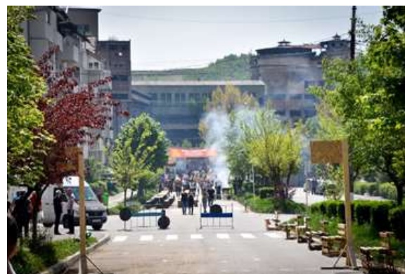
Fig. 10. Minei street, pedestrianized and waiting for visitors. Rolland Szedlacsek (2018)

In this event, Minei street became a pedestrian area free for an artistic installation, an info point, sports competitions, a picnic, the opening of an informal underground museum and a theatre play. Also, the street was the starting point for an architectural tour on bicycles. The Ion D. Sirbu Memorial House was animated by children playing piano and reading from Ion D. Sirbu himself.