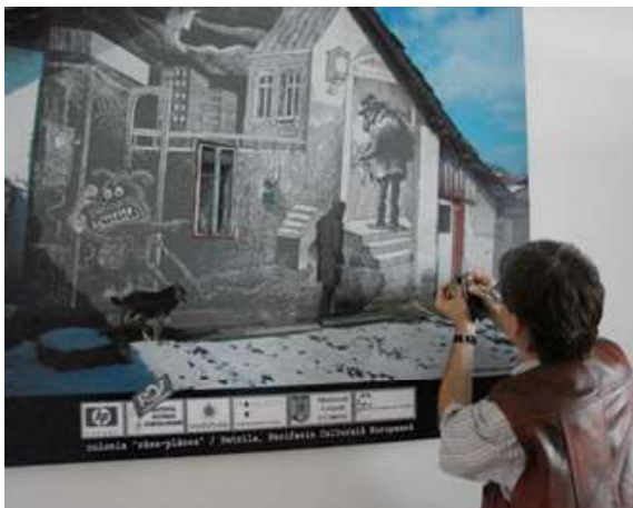
Fig. 5. Colonia Rasa Plansa project presented in Timisoara, at the Baroque Palace.

In 2006, Barbu impressed through the initiative to revitalize a former miners colony: Bratianu neighborhood in Lonea, Petrila. Through the Colonia Rasa Plansa project, he managed to present the grey neighborhood as a lively ensemble of homes, lived by people with a high sense of humor and culture.